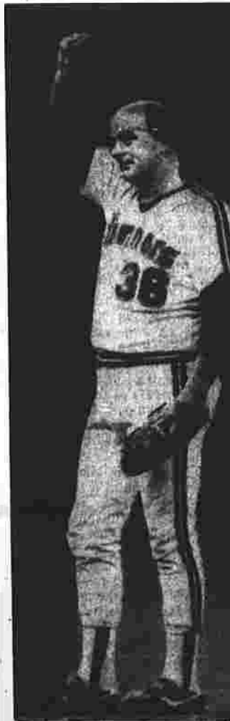
'Thanks' Gaylord Perry of Seattle tips his cap to crowd's reaction when informed Detroit's Lance Parrish was his 100th strikeout victim this season.