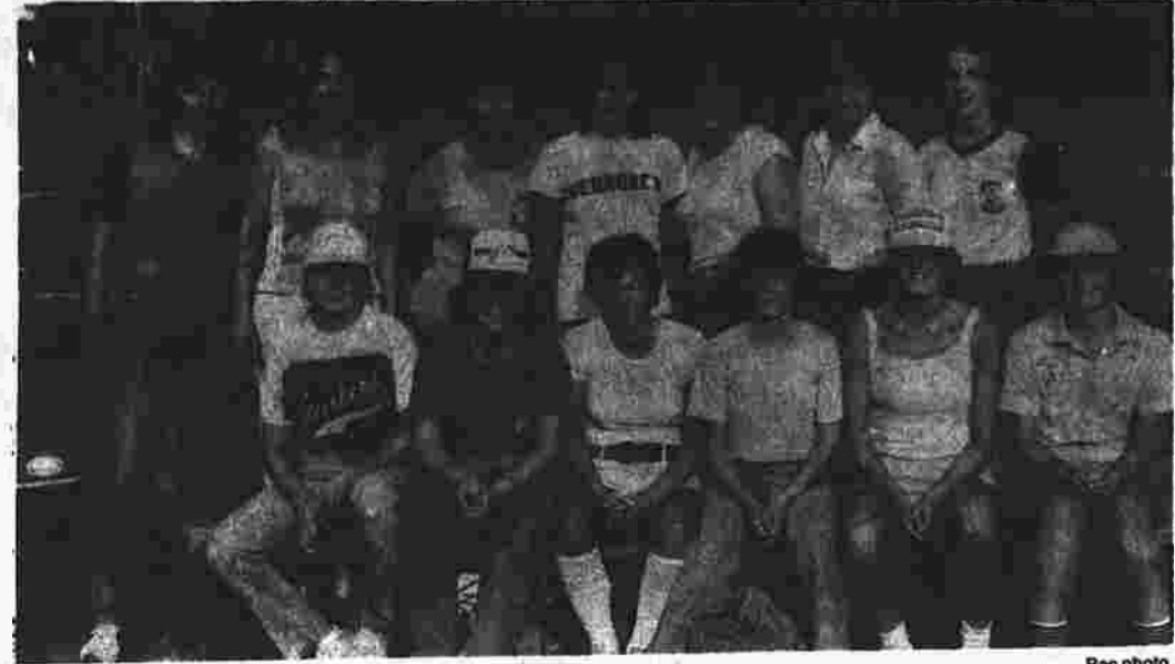
Women's Rec League softball winners