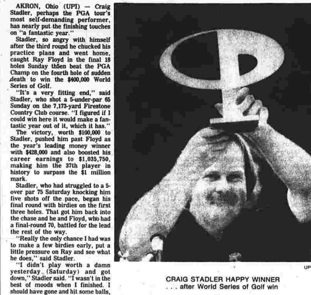
CRAG STADLER HAPPY WINNER after World Series of Golf win

AKRON, Ohio (UPI) — Craig Stadler, perhaps the PGA tour's most self-demanding performer, has nearly put the finishing touches on "a fantastic year."